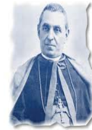
Blessed G. B. Scalabrini

John Baptist Scalabrini (1839-1905), Bishop of Piacenza, lived the drama of the exodus of migrants who, during the last decades of the nineteenth century, traveled in great numbers from Europe to the countries in the New World. He clearly saw the need for a specific pastoral care of migrants through a suitable network of spiritual assistance. In this perspective, and giving proof of a keen spiritual insight and a concrete practical sense, he